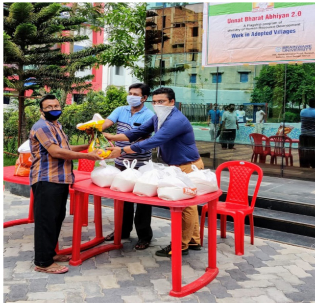
Brainware in association with Barasat Police station distributed 750kg rice & 150kg dal of free ration among 150 underprivileged local.